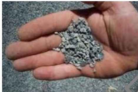
Illustration 2: Quarter minus bedding material

Historically, plumbers have bedded drains in materials (quarter minus) with a nominal size of a quarter of an inch, or approximately 6mm. As these products have stood the test of time, the VBA will continue to accept the use of such materials, provided they appear consistent in size upon visual inspection, as shown in the Illustration 2 below.